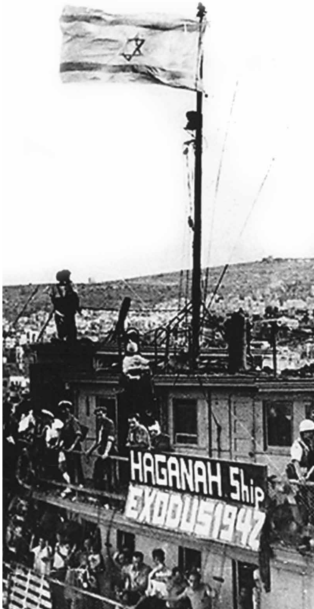
The Exodus 1947 before the British Navy boarded it. Built in 1928, the ship was formerly the packet steamer SS President Warfield, which carried freight and passengers between Norfolk, VA and Baltimore, MD.

Currently, AJHS archivists are integrating the Machal collection into the Society's holdings, and preparing to welcome researchers who wish to use the collection. AJHS will also display an exhibition about the American volunteers in Israel's war for independence at the Center for Jewish History during 2011.