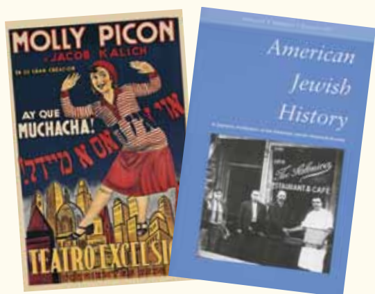
1. Nostalgic Molly Picon poster (16” x 20”) 2. American Jewish History journal

To become a member please visit our website at www.ajhs.org or call 1-866-740-8013.