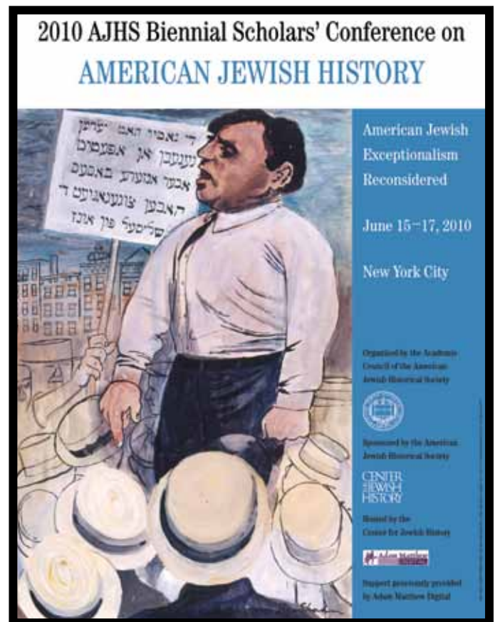
Ben Shahn (1898-1969) East Side Soap Box, 1936. Gouache on paper, 18 ½ x 12 ¼ in.