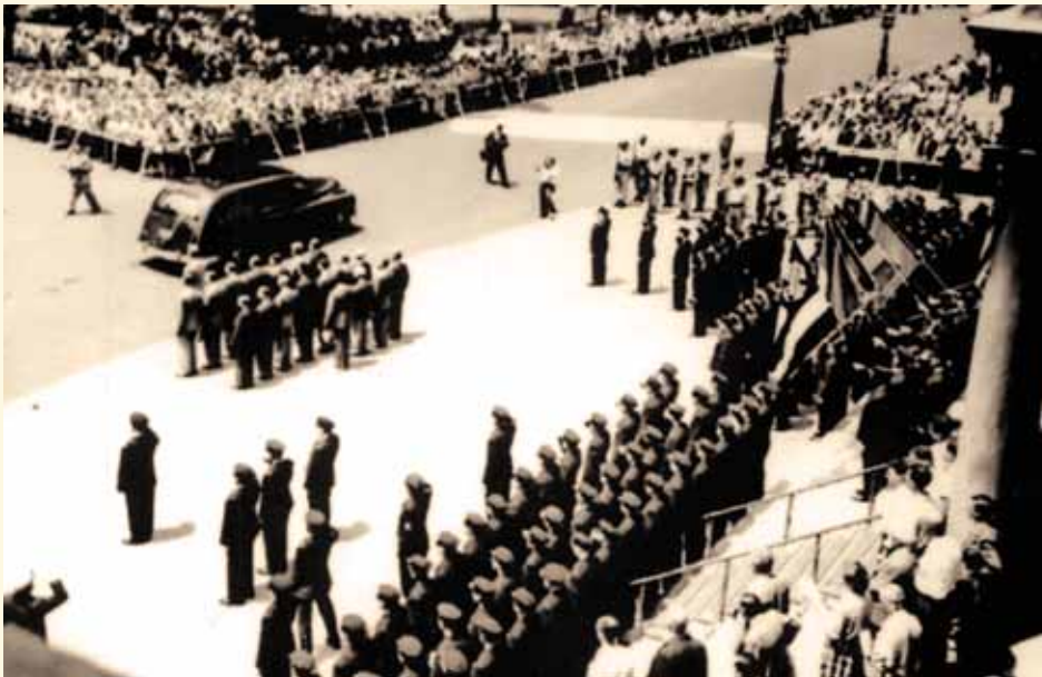
Funeral of Mickey Marcus, Union Temple, Brooklyn, NY, June 1948. Marcus was buried at the United States Military Academy, West Point, NY.