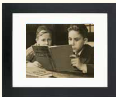
3. Two boys reading Hebrew.