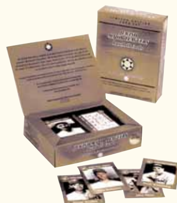
4. Original gold embossed box of Jewish Major Leaguer cards